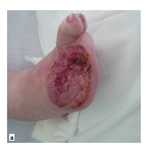
Figure 1a. Baseline presentation of an infected toe amputation site.

Chronic wounds are defined as wounds that do not heal in an orderly and predictable manner within six weeks. <sup>26,27</sup> Natural healing requires the host to mount a cellular response with proper migration of cells, thereby eliminating invading organisms or foreign