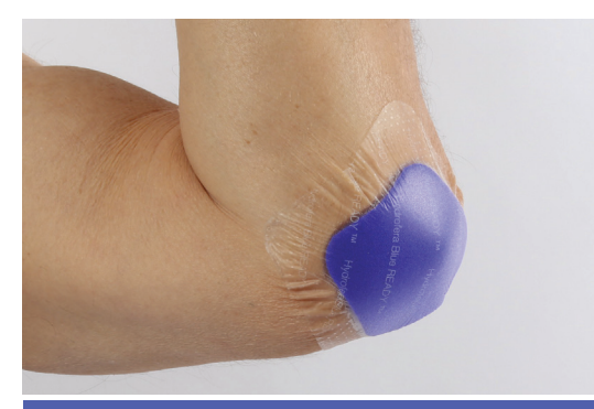
Secure fit for difficult-to-dress areas and mobility