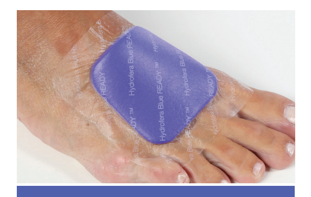
Diabetic foot ulcers